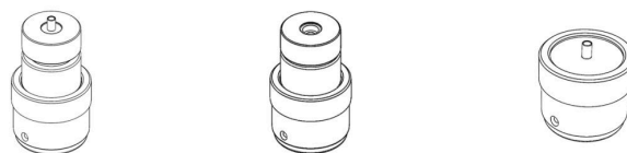
Fig.3 CRY3719-S01 Coupler Set Optional Acoustic Chamber Configuration Diagram

Here are the three optional acoustic chamber configuration diagrams for the CRY3719-S01 Coupler Set. You can freely choose and combine the most suitable chamber configuration based on your specific testing needs. Please note that the provided diagrams are for reference purposes only and can be further customized according to your specific requirements and objectives.